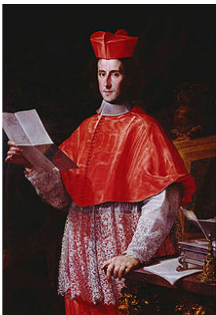
Fig. 1. Pietro Ottoboni

phenomena peculiar to a certain historic period is of a great interest. There are bright examples of the creators' conscious aspiration for a universal artistic language. The baroque epoch is marked with attraction to synthesis of arts. Italian masters contrived original forms of interaction of various arts. Thus, music and poetry, architecture and art of a theatre set were organically interconnected in baroque theatre. Landscape ensemble displayed not only the unity of plastic arts and nature but also the transfer of principles and ways of a theatre stage's space design. Academies, propagated in Italy in the XVII –the first half of the XVIII centuries and uniting patrons, architects, artists, musicians and poets, can also serve an example of such interconnection. The history of a creative union of Pietro Ottoboni (1667–1740), a cardinal (Fig. 1), Arcangelo Corelli (1653–1713), a composer (Fig. 2), and Carlo Fontana (1668–1708), an architect (Fig. 3), is not widely known. However, the result of their cooperation was embodied in a grand idea of the establishment of