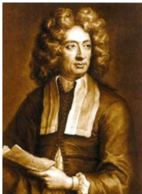
Fig. 2. Arcangelo Corelli