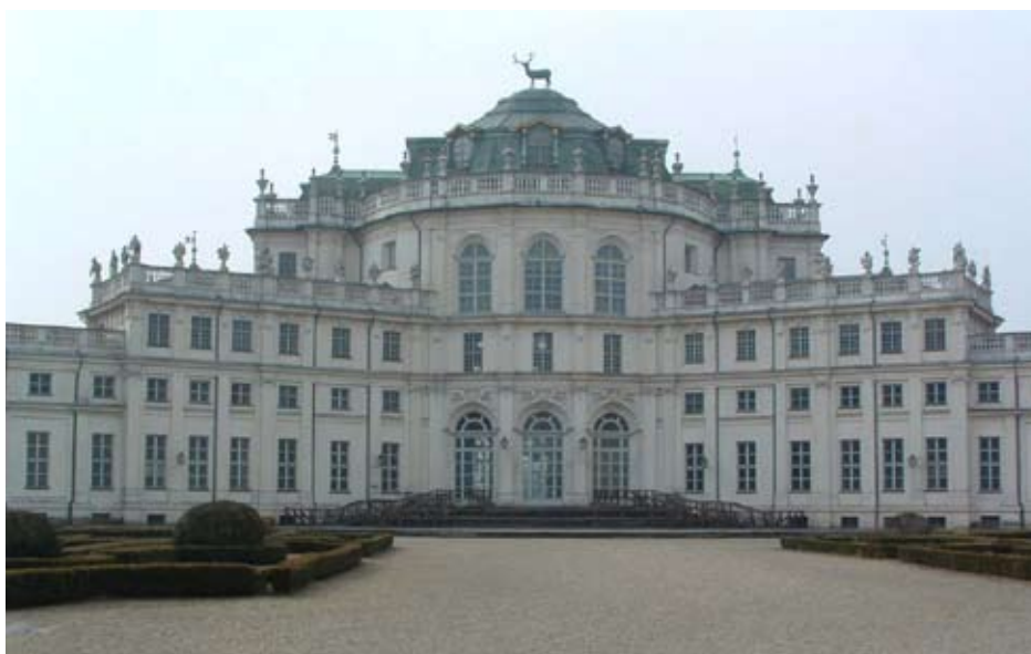
Fig. 6. The Palazzina di caccia of Stupinigi by Filippo Juvarra

segmentations enable to limit the surface in the same direction and compositionally emphasize a dominating part. One of the conditions of depth is connected with segmentations of architectural volume according to these two coordinates. It also depends on the conditions of perspective or, in other words, on a form's position in space and its remoteness from a viewer. They distinguish an architectural form's position in depth, in general front, in front of other forms. (Let's remember the division into relief and front planes in a musical composition.) The forms which are near a viewer are perceived clearly, distinctly, as relief ones. As the distance becomes greater the details start disappearing, forms' voluminosity and relief gradually turn to flatness and silhouette-like, clarity of colour correlations becomes less, colour saturation is absorbed..." (Krinskii, Lamtsov, Turkus, 1968, p. 112). Thus, depth as a form's feature manifests itself in dynamics and depends on a viewer's motion in space or his active visual perception (various trajectories of the gaze motion, noticing significant details). Division into texture's planes in music can be comparable