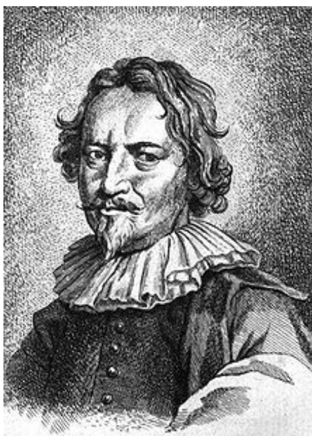
Fig. 3. Carlo Fontana